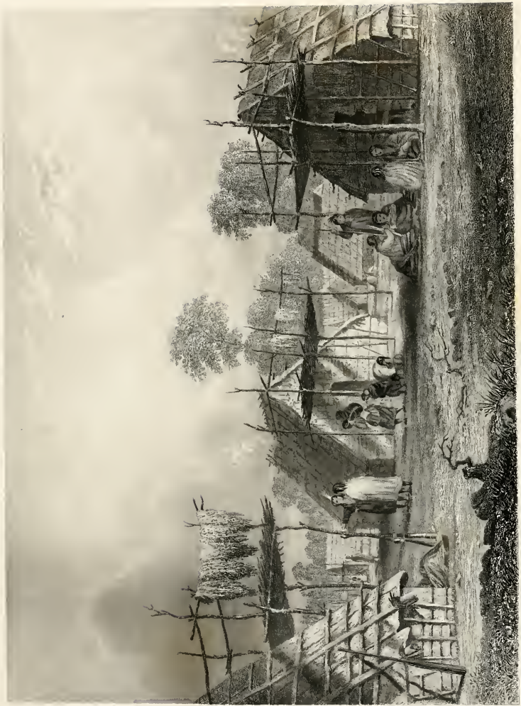
THE VILLAGE OF THE MOUNTAINS